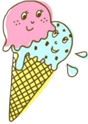
I ice cream