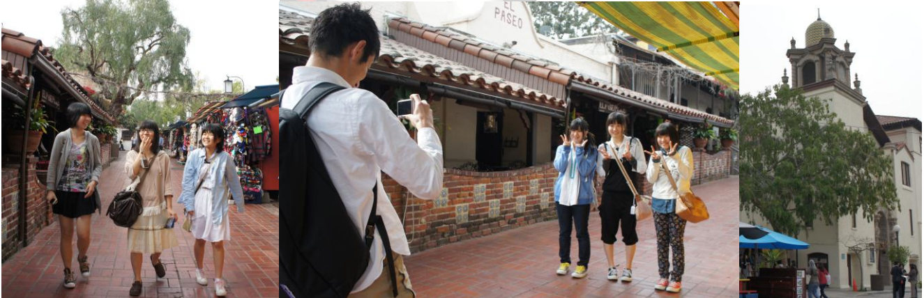
El Pueblo de la Reina de Los Angeles

On this full day excursion to LA, we visited El Pueblo de la Reina de Los Angeles, Staple Center, Veins Beach, Farmers Market and Hollywood. Seeing a lot of famous places and talking to many people became a wonderful experience.